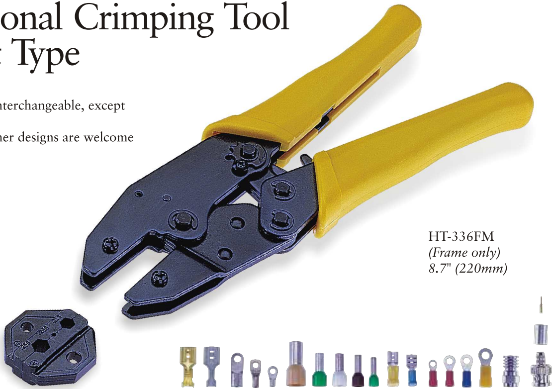
HT-336FM (Frame only) 8.7" (220mm)